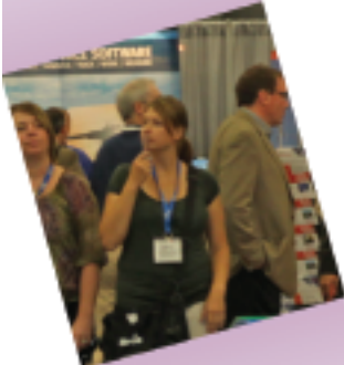
Exhibit in the mid-Atlantic, a hot spot for utility technology!

Exhibitors will receive a link to the online exhibit services kit, which contains information about ordering furniture, labor, shipping and drayage services, electricity, and more.